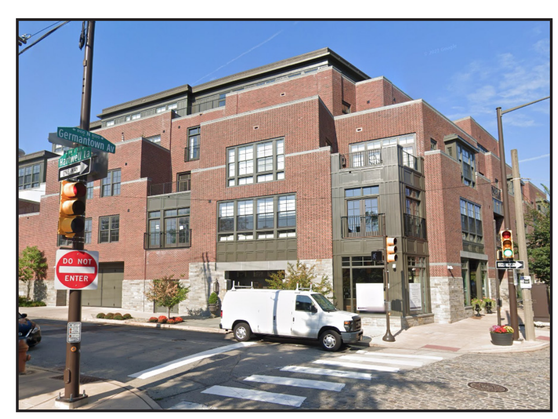
Chestnut Hill (New Construction)