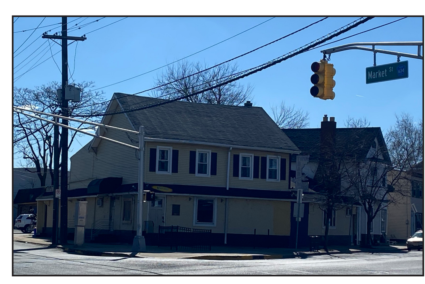
200 S. Broadway (Jack's Twin Bar)