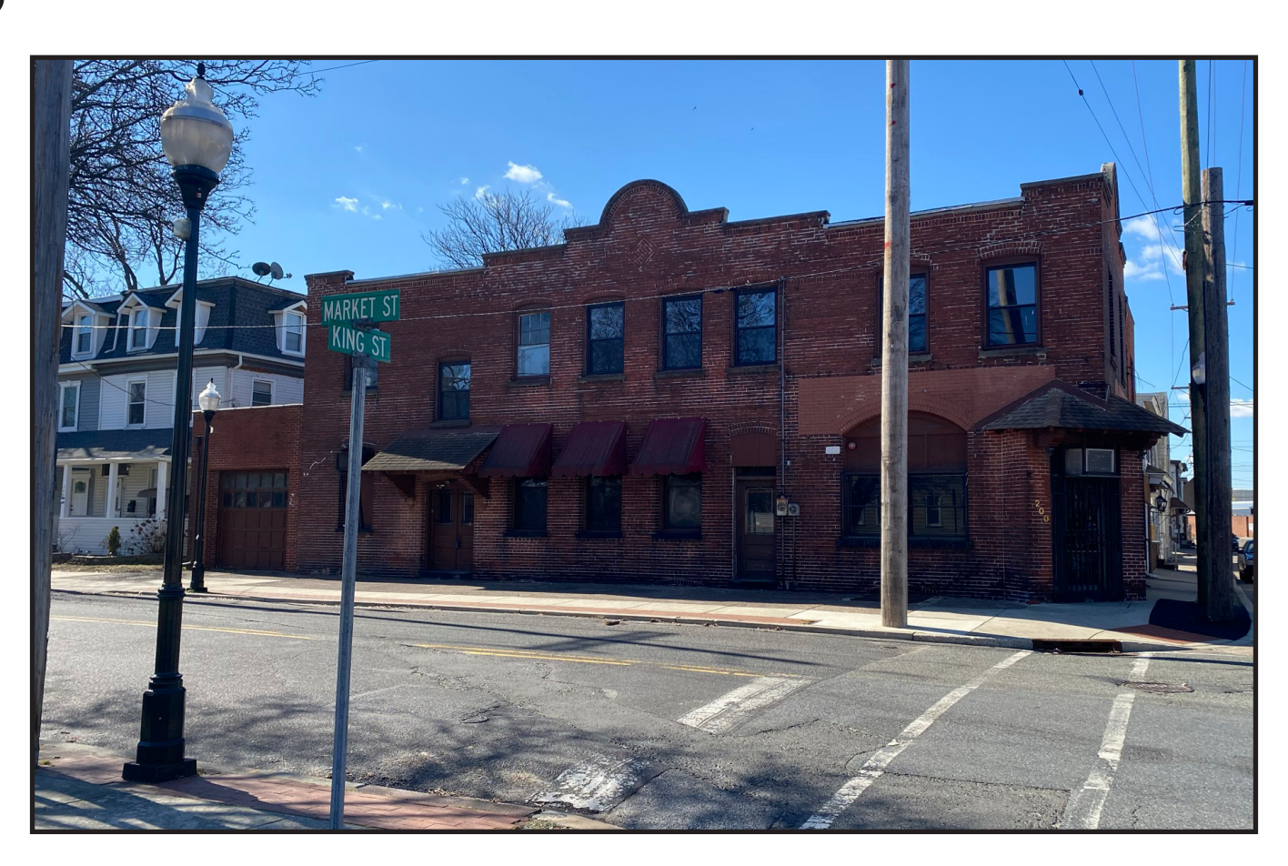
200 King Street