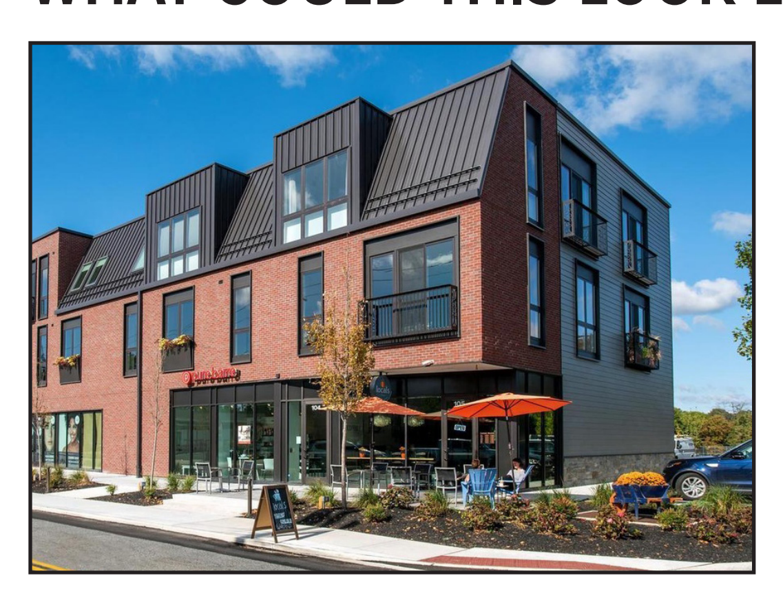
Wyndmoor (New Construction)