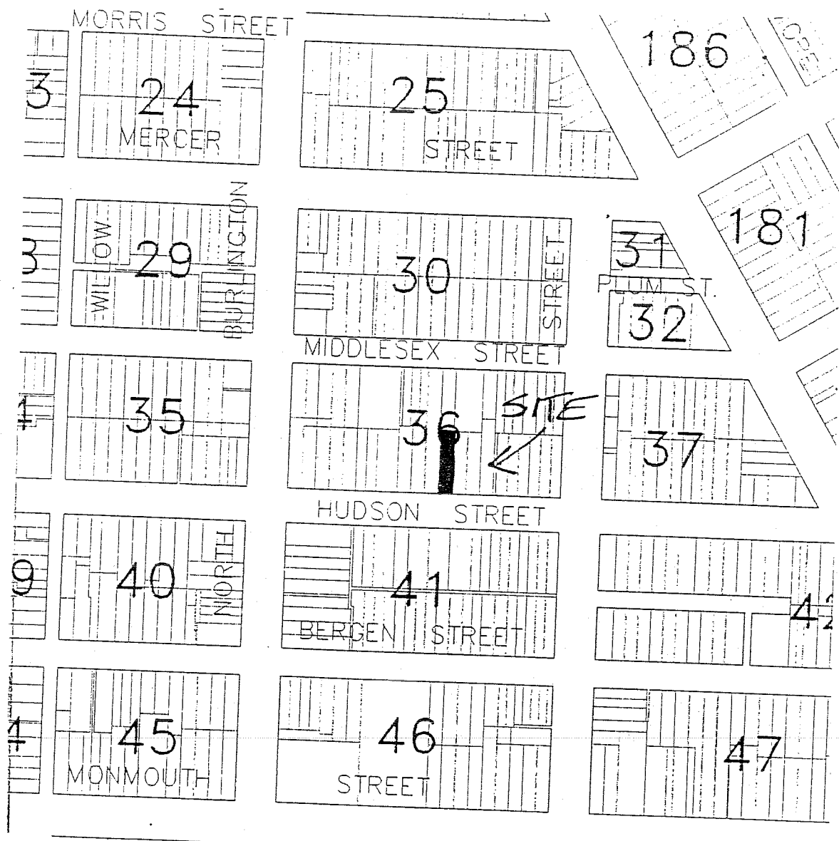
Figure 1: Location Map 323 HUDSON STREET PROJECT AREA (Block 36, Lot 6.01)