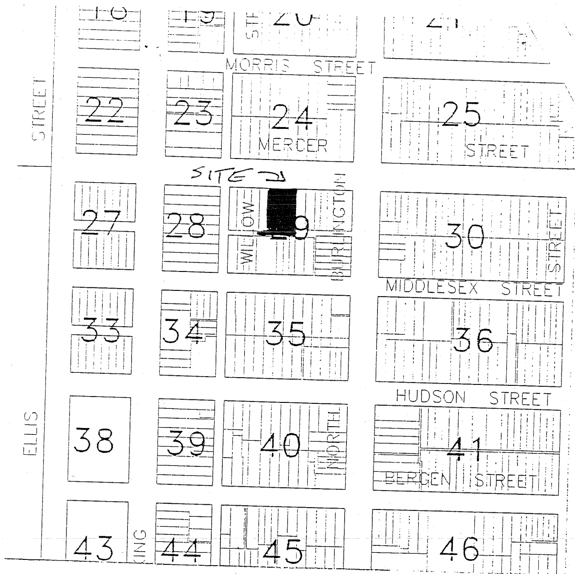
Figure 1: Location Map 222 MERCER STREET PROJECT AREA (Block 29, Lots 8, 9, 10, 27, and 28)