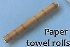
Paper towel rolls