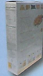
Paperboard boxes (cereal, pasta & tissue)