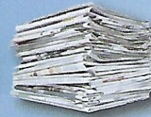
Phone books Newspapers, magazines, brochures & inserts (no bags, do not tie & bundle)