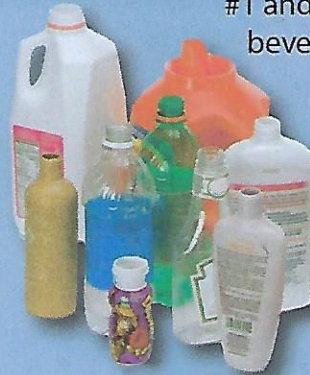
#1 and #2 Plastic food & beverage containers